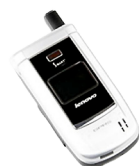
Lenovo P930 Symbian OS